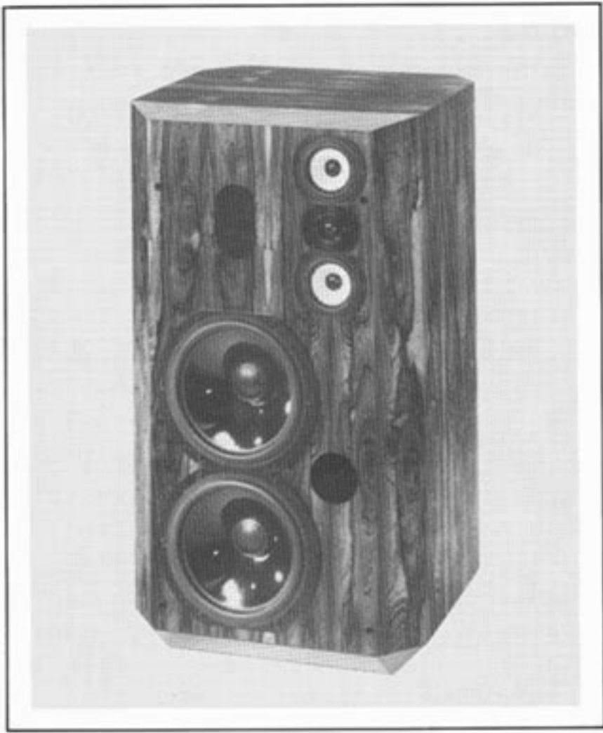
REPLACEMENT PARTS MANUAL